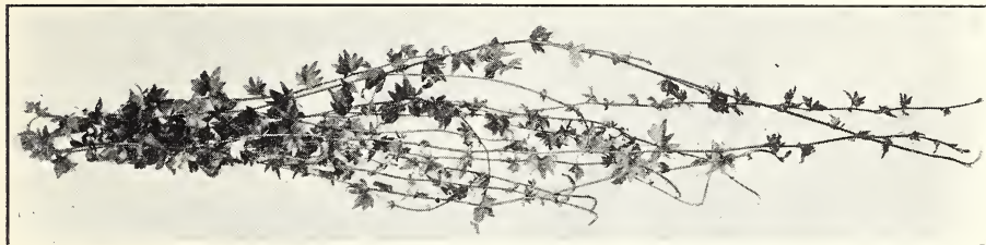
AMPELOPSIS INCONSTANS LOWII